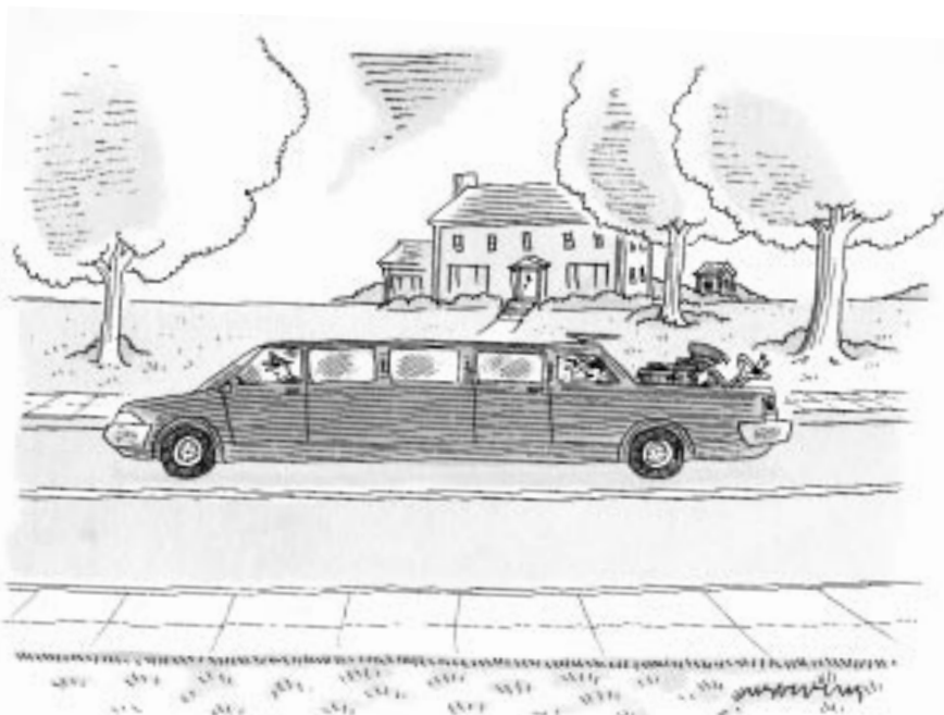
"Lawn care has been good to us, Ed."

But sometimes, just when the brain is about to give up, an insight appears.