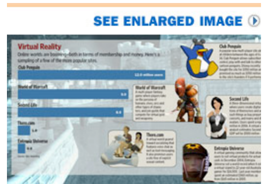
A closer look at some popular online worlds.